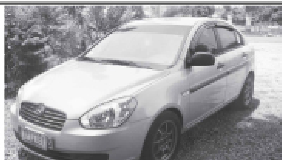
Hyundai Accent CRDI 2012 model, casa maintained, under factory warranty, leather seat, 15 magwheels, perfect condition, owner driven. Negotiable at P650,000