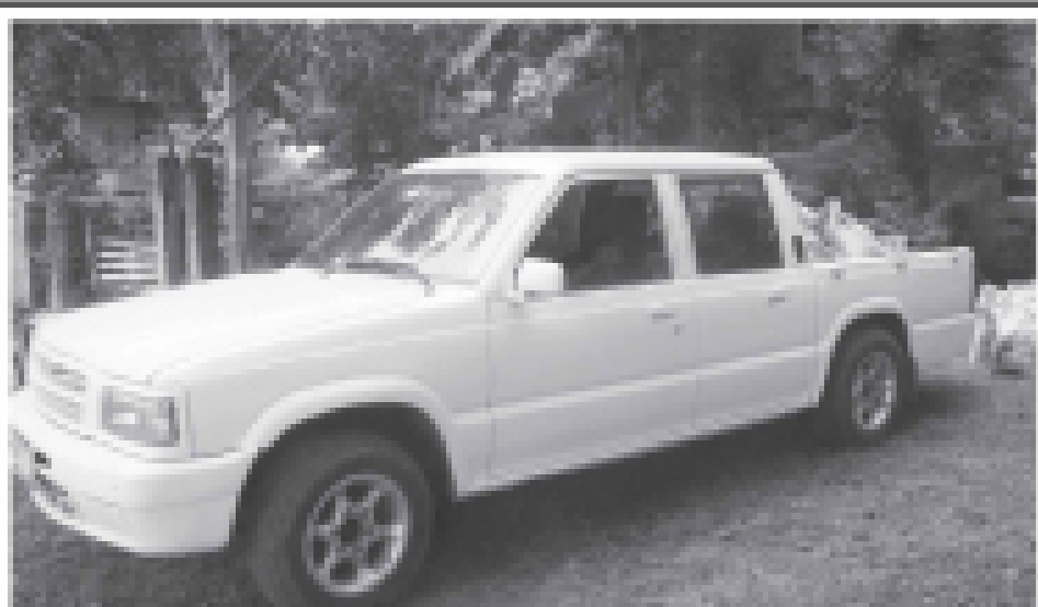
1997 Mazda B2500 pick up. strong engine and aircon, nothing to fix, nice in and out. P245K. Negotiable. 0917 627 5521

Pedro C. Andal Sr. Compound, Maharlika Hi-way, Concepcion Uno, Sariaya, Quezon contact: 0917-627-5521 / 0920-951-1248