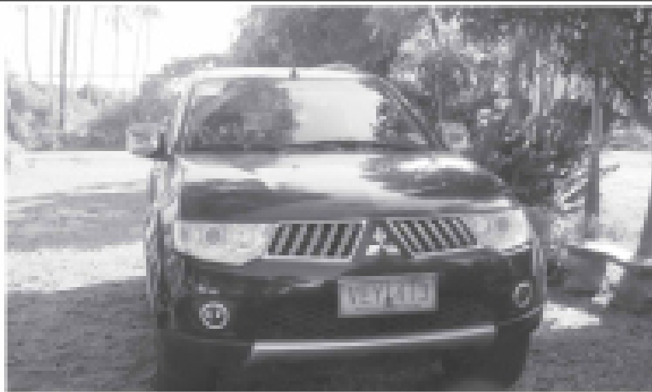
Montero 2010 model, almost new, casa maintained, 40k mileage, owner driver. Asking for P1M. Negotiable. 0920 951 1248