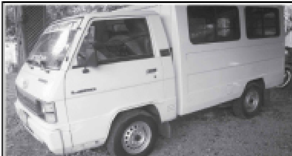
1999 Mitsubishi L300 FB, good engine, collapsible seat, nothing to fix. P235k or best offer 0920 951 1248