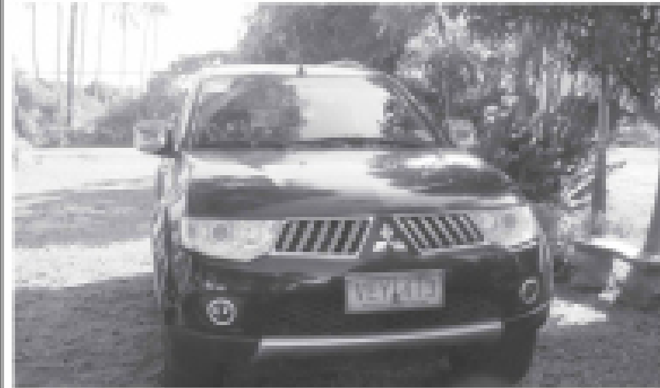
Montero 2010 model, almost new, casa maintained, 40k mileage, owner driver. Asking for P1M. Negotiable. 0920 951 1248