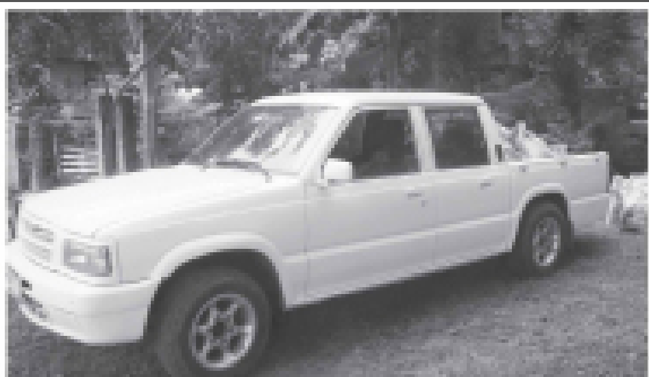
1997 Mazda B2500 pick up. strong engine and aircon, nothing to fix, nice in and out. P245K. Negotiable. 0917 627 5521