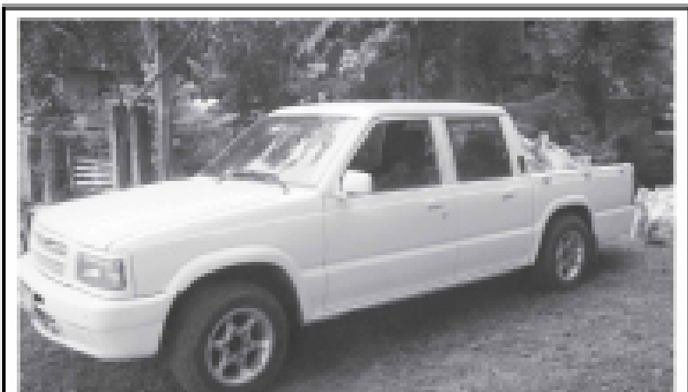
1997 Mazda B2500 pick up. strong engine and aircon, nothing to fix, nice in and out. P245K. Negotiable. 0917 627 5521

Pedro C. Andal Sr. Compound, Maharlika Hi-way, Concepcion Uno, Sariaya, Quezon contact: 0917-627-5521 / 0920-951-1248