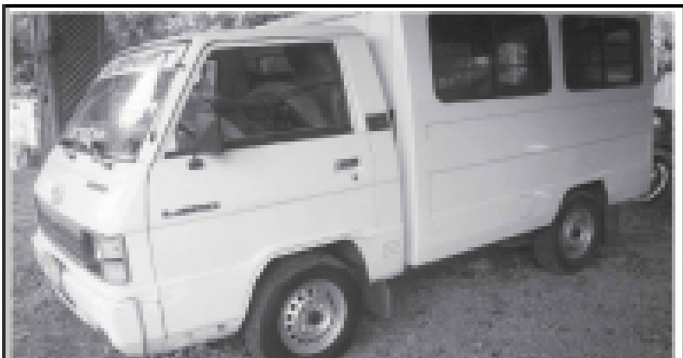
1999 Mitsubishi L300 FB, good engine, collapsible seat, nothing to fix. P235k or best offer 0920 951 1248