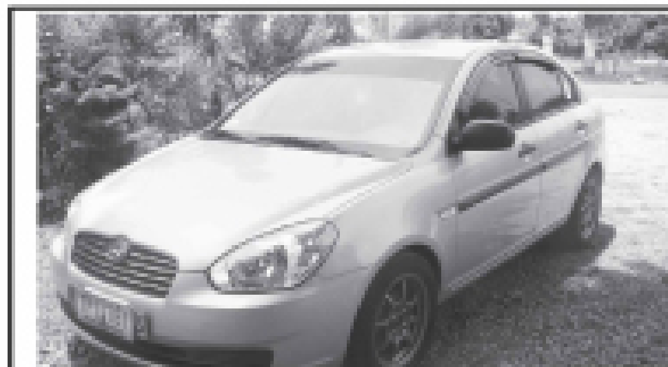
Hyundai Accent CRDI 2012 model, casa maintained, under factory warranty, leather seat, 15 magwheels, perfect condition, owner driven. Negotiable at P650,000