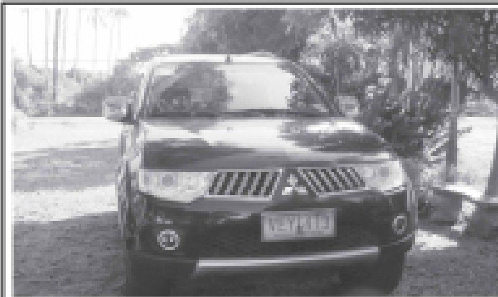
Montero 2010 model, almost new, casa maintained, 40k mileage, owner driver. Asking for P1M. Negotiable. 0920 951 1248