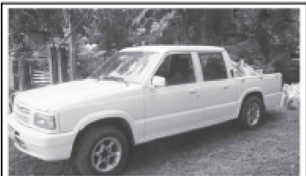
1997 Mazda B2500 pick up. strong engine and aircon, nothing to fix, nice in and out. P245K. Negotiable. 0917 627 5521

Pedro C. Andal Sr. Compound, Maharlika Hi-way, Concepcion Uno, Sariaya, Quezon contact: 0917-627-5521 / 0920-951-1248