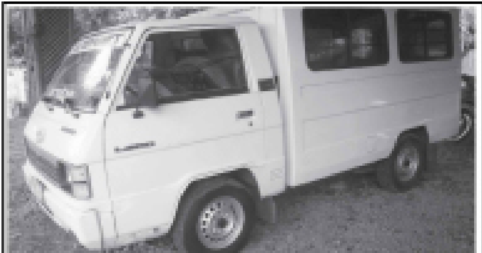
1999 Mitsubishi L300 FB, good engine, collapsible seat, nothing to fix. P235k or best offer 0920 951 1248