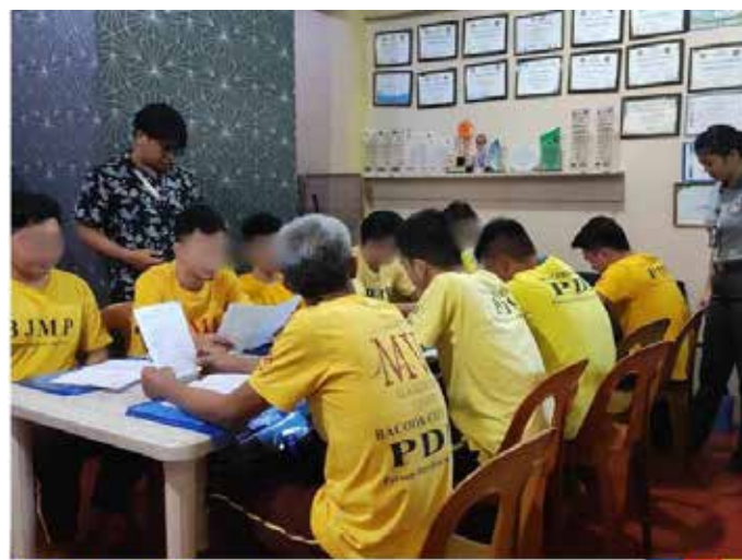
BUREAU OF JAIL MANAGEMENT AND PENOLOGY BACOR CITY JAIL MALE DORMITORY "Shaping Lives, Building a Better Nation" www.bjmp.gov.ph | 8098 Regional Office Callcenter