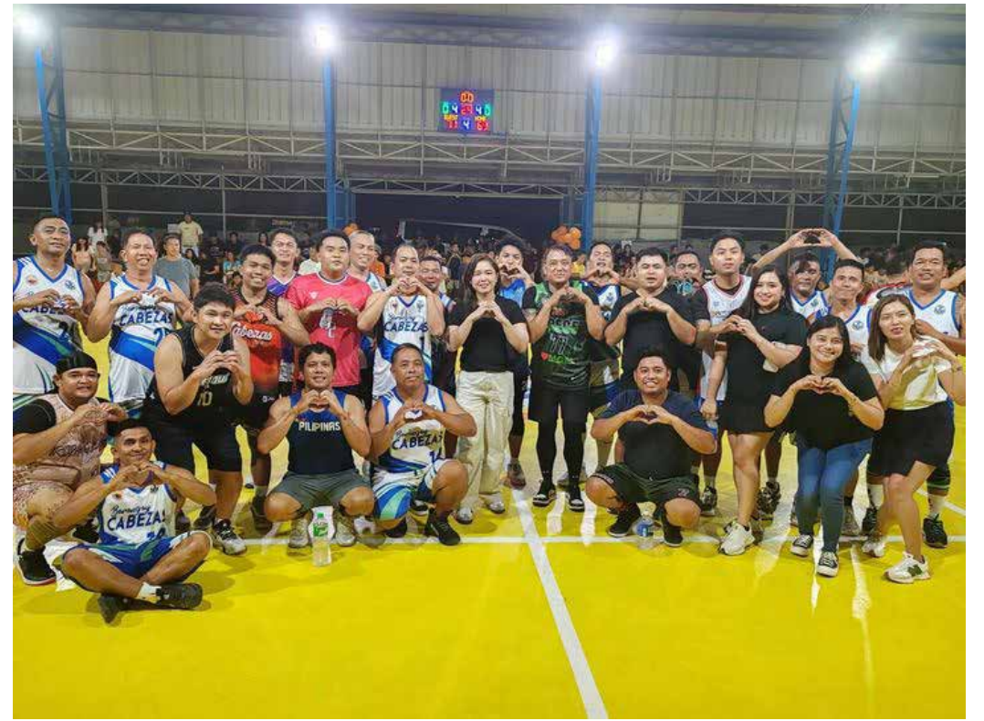
It's a wrap for today. Congratulations SK Cabezas for the opening of their Basketball League. Friendly game between Sangguniang Panlungsod vs Sangguniang Barangay 3-0. Oh matulog na kayo, be ready na para bukas, wala na kayong announcement na kailangang hintayin. Siguraduhin na magdala ng payong, bimpo, sapat na tubig at small efan o pamaypay. Sa wakas, makikita nyo na si crush ☐ Love you all, kahit love nyo lang ako kapag may suspension ng klase. ☐ #MayPasokSaTrece ☐MGBL