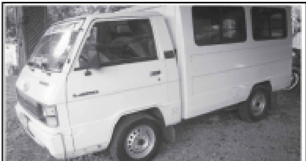
1999 Mitsubishi L300 FB, good engine, collapsible seat, nothing to fix. P235k or best offer 0920 951 1248