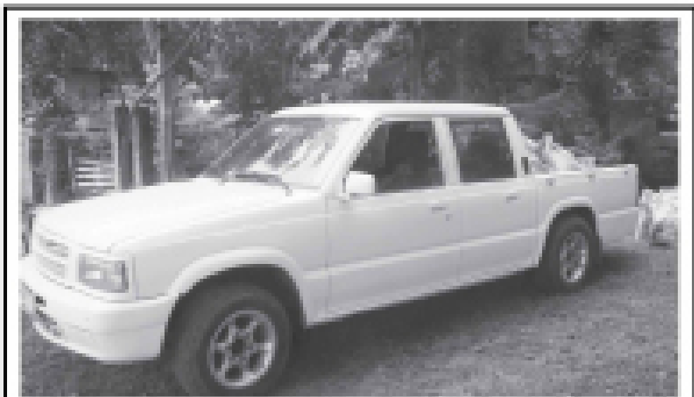
1997 Mazda B2500 pick up. strong engine and aircon, nothing to fix, nice in and out. P245K. Negotiable. 0917 627 5521

Pedro C. Andal Sr. Compound, Maharlika Hi-way, Concepcion Uno, Sariaya, Quezon contact: 0917-627-5521 / 0920-951-1248