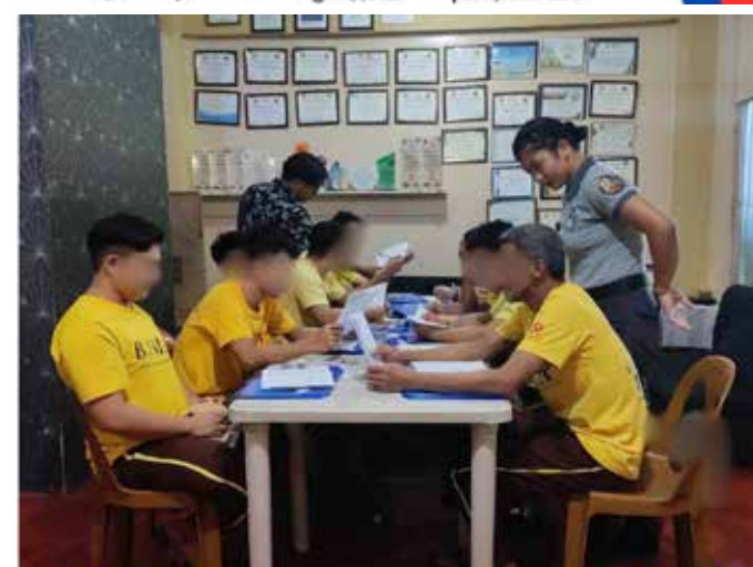
BUREAU OF JAIL MANAGEMENT AND PENOLOGY BACOR CITY JAIL MALE DORMITORY "Shaping Lives, Building a Better Nation" www.bjmp.gov.ph | 8098 Regional Office Callcenter

Hindi hadlang para sa mga Person Deprived of Liberty (PDL) na nasa pangangalaga ng Bacoor City Jail Male Dorm ang kanilang pagkakapiit upang maipagpatuloy ang kanilang pag-aaral.