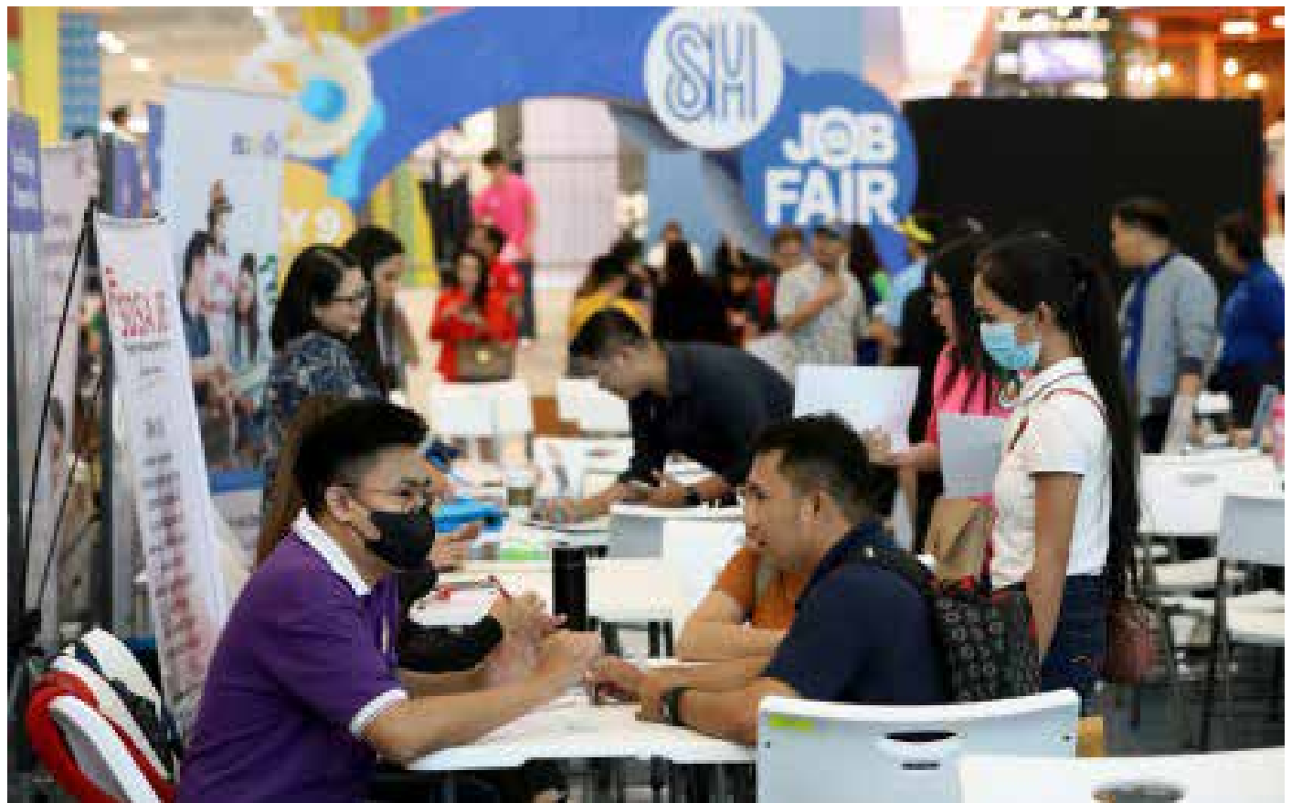
JOB FAIR. Job seekers troop to the Trabaho Para Sa Bayan Job Fair at the SM Mall of Asia Music Hall in Pasay City on Thursday (May 9, 2024). A partnership among the Private Sector Advisory Council, the SM Foundation, and other business groups, the job fair offered thousands of slots for job hunters.

“Para may ginagawa na ako habang naghihintay ng grad-