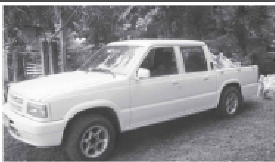
1997 Mazda B2500 pick up. strong engine and aircon, nothing to fix, nice in and out. P245K. Negotiable. 0917 627 5521

Pedro C. Andal Sr. Compound, Maharlika Hi-way, Concepcion Uno, Sariaya, Quezon contact: 0917-627-5521 / 0920-951-1248