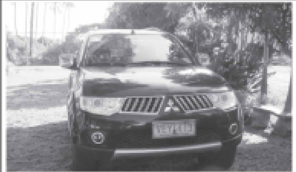
Montero 2010 model, almost new, casa maintained, 40k mileage, owner driver. Asking for P1M. Negotiable. 0920 951 1248