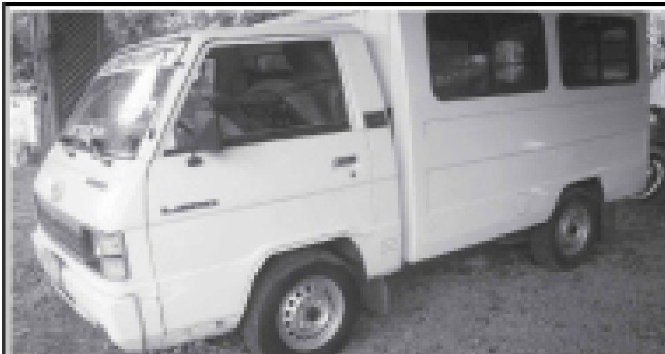
1999 Mitsubishi L300 FB, good engine, collapsible seat, nothing to fix. P235k or best offer 0920 951 1248