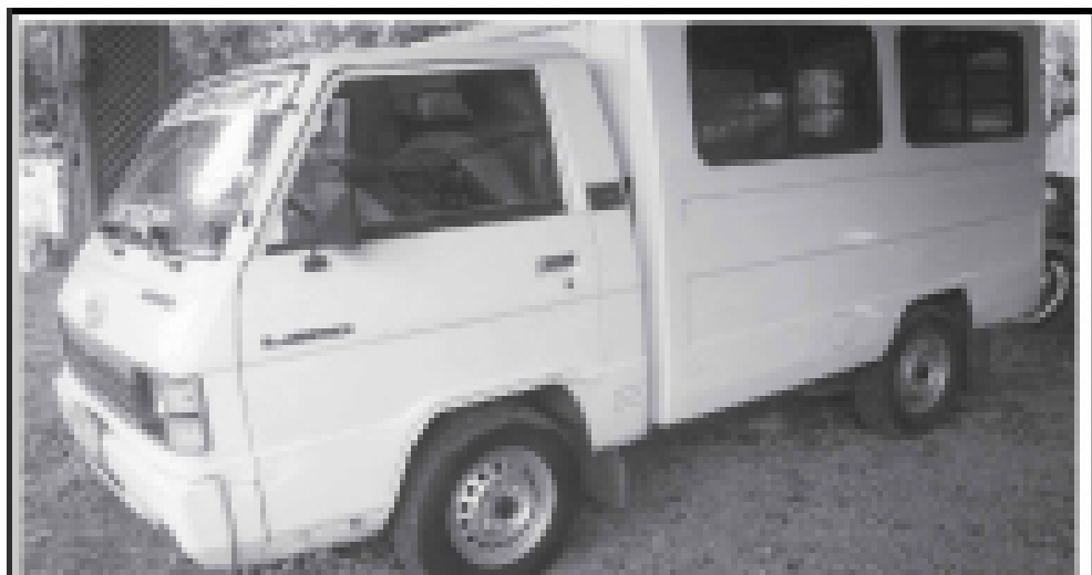
1999 Mitsubishi L300 FB, good engine, collapsible seat, nothing to fix. P235k or best offer 0920 951 1248