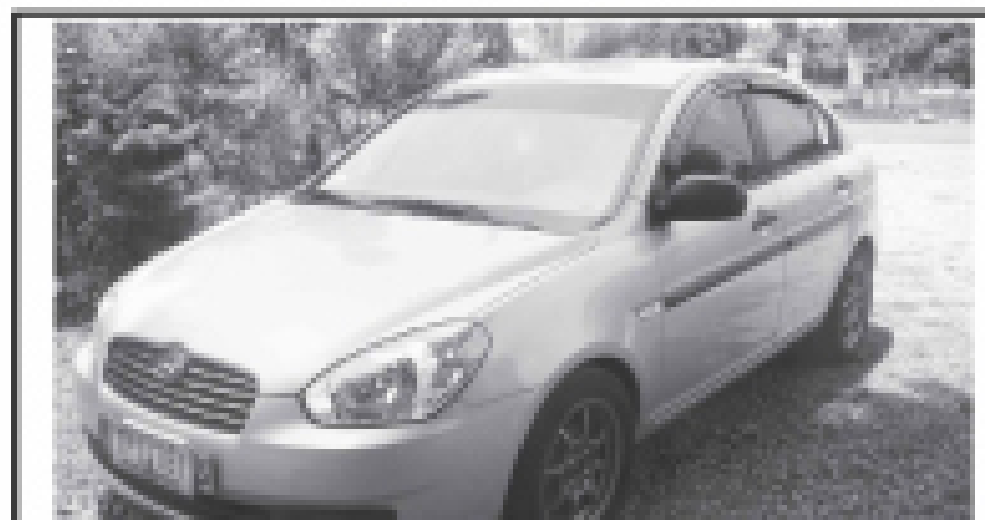
Hyundai Accent CRDI 2012 model, casa maintained, under factory warranty, leather seat, 15 magwheels, perfect condition, owner driven. Negotiable at P650,000