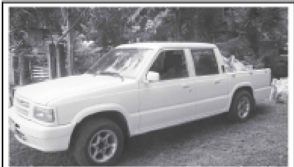
1997 Mazda B2500 pick up. strong engine and aircon, nothing to fix, nice in and out. P245K. Negotiable. 0917 627 5521

Pedro C. Andal Sr. Compound, Maharlika Hi-way, Concepcion Uno, Sariaya, Quezon contact: 0917-627-5521 / 0920-951-1248