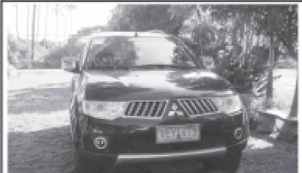
Montero 2010 model, almost new, casa maintained, 40k mileage, owner driver. Asking for P1M. Negotiable. 0920 951 1248