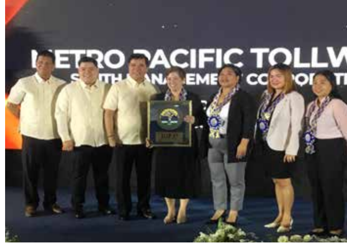
The City Government of Imus, led by Mayor Alex "AA" L. Advincula, celebrates its 12th Cityhood Anniversary today, June 27, 2024, by recognizing the top 40 taxpayers. In his address, Mayor Advincula acknowledged the unwavering support and trust of taxpayers in the city government, which enables the delivery of excellent services, programs, and projects to the Imuseños.

Alam mo ba? Makakatipid ka ng hanggang anim na litrong tubig sa bawat minutong pagbawas sa paggamit ng shower. May mga simpleng paraan para magtipid ng tubig sa bahay! #WagPataksaya araw-araw. Every drop matters, kaya patak-patak tayo to save water. #WaterForLife #EnvironmentForLife