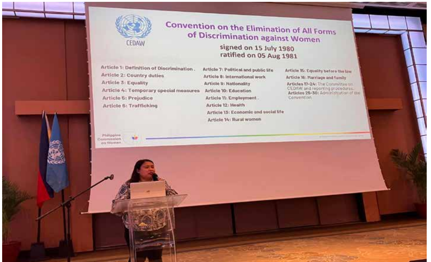
PHRCS invites NGOs and civil society organizations to hold discussions focusing on prevalent human rights issues and concerns in the country which include civil and political rights, women empowerment, opportunities for people with disabilities, Indigenous Peoples’ rights, migrant worker protection, and prevention of cruel, inhumane, and degrading treatment.