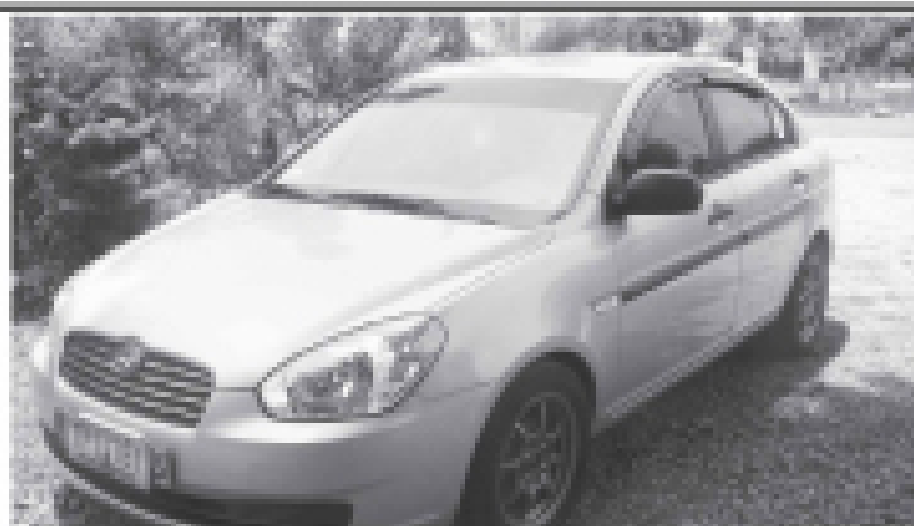
Hyundai Accent CRDI 2012 model, casa maintained, under factory warranty, leather seat, 15 magwheels, perfect condition, owner driven. Negotiable at P650,000