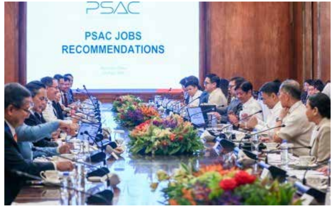
WORK IMMERSION. President Ferdinand R. Marcos Jr. presides over a meeting with the Private Sector Advisory Council (PSAC) and officials from the Department of Education on Thursday (Aug. 8, 2024) in Malacañang. The PSAC and DepEd signed a memorandum of agreement that will set in motion an "enhanced work immersion" program for senior high school students beginning this school year to boost their employability and address jobs and skills mismatch.

"This initiative aims to bridge the gap between theoretical education and practical industry experience, making students more attrac-