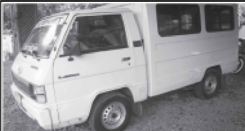
1999 Mitsubishi L300 FB, good engine, collapsible seat, nothing to fix. P235k or best offer 0920 951 1248