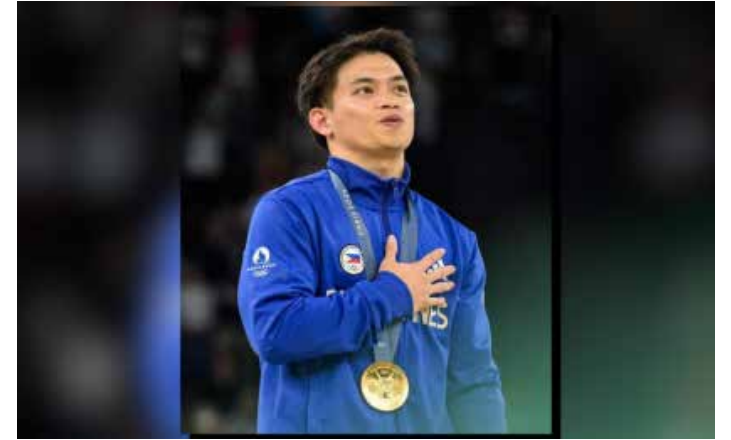
Paris Olympics double gold medalist Carlos Yulo

the magnanimity of a Filipino athlete, Carlos Edriel P. Yulo deserves utmost recognition and commendation,” the resolution read.