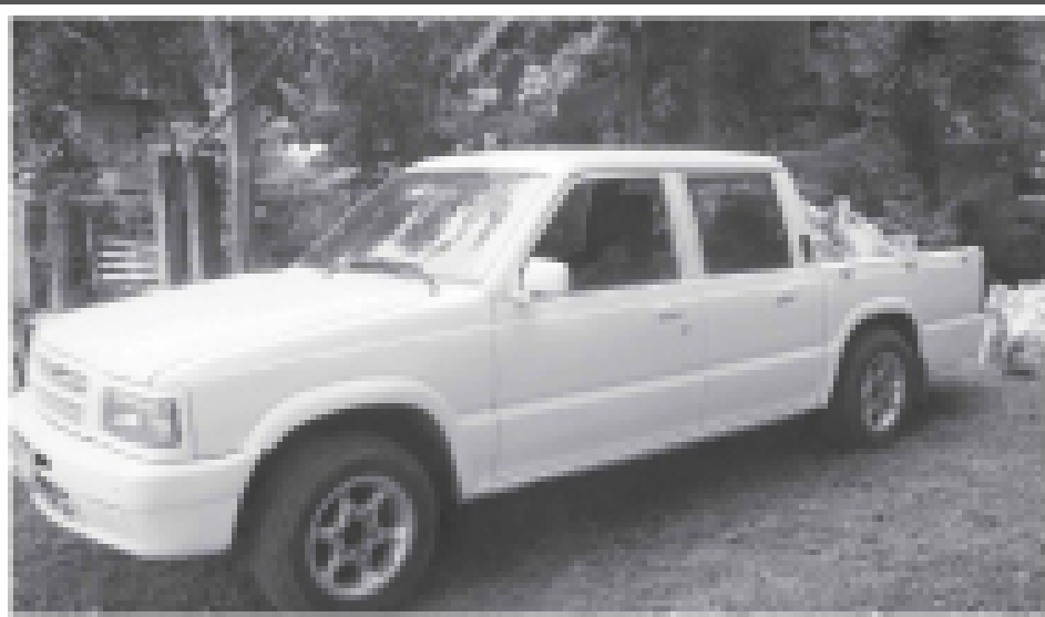
1997 Mazda B2500 pick up. strong engine and aircon, nothing to fix, nice in and out. P245K. Negotiable. 0917 627 5521

Pedro C. Andal Sr. Compound, Maharlika Hi-way, Concepcion Uno, Sariaya, Quezon contact: 0917-627-5521 / 0920-951-1248