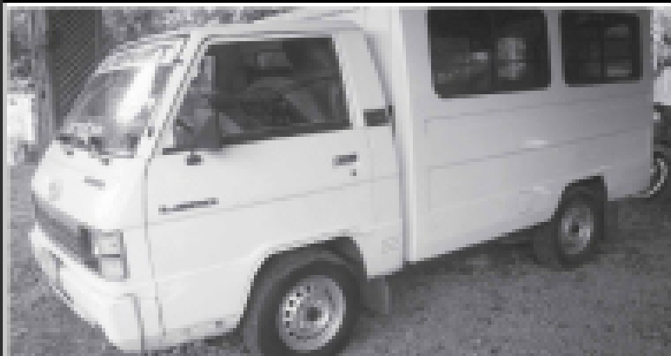
1999 Mitsubishi L300 FB, good engine, collapsible seat, nothing to fix. P235k or best offer 0920 951 1248