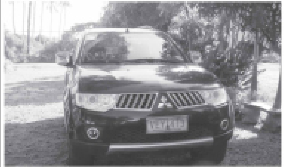
Montero 2010 model, almost new, casa maintained, 40k mileage, owner driver. Asking for P1M. Negotiable. 0920 951 1248