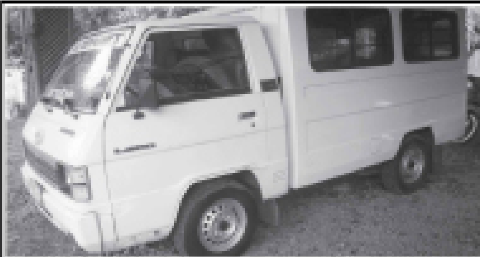
1999 Mitsubishi L300 FB, good engine, collapsible seat, nothing to fix. P235k or best offer 0920 951 1248