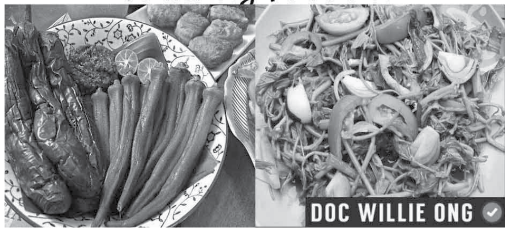
DOC WILLIE ONG