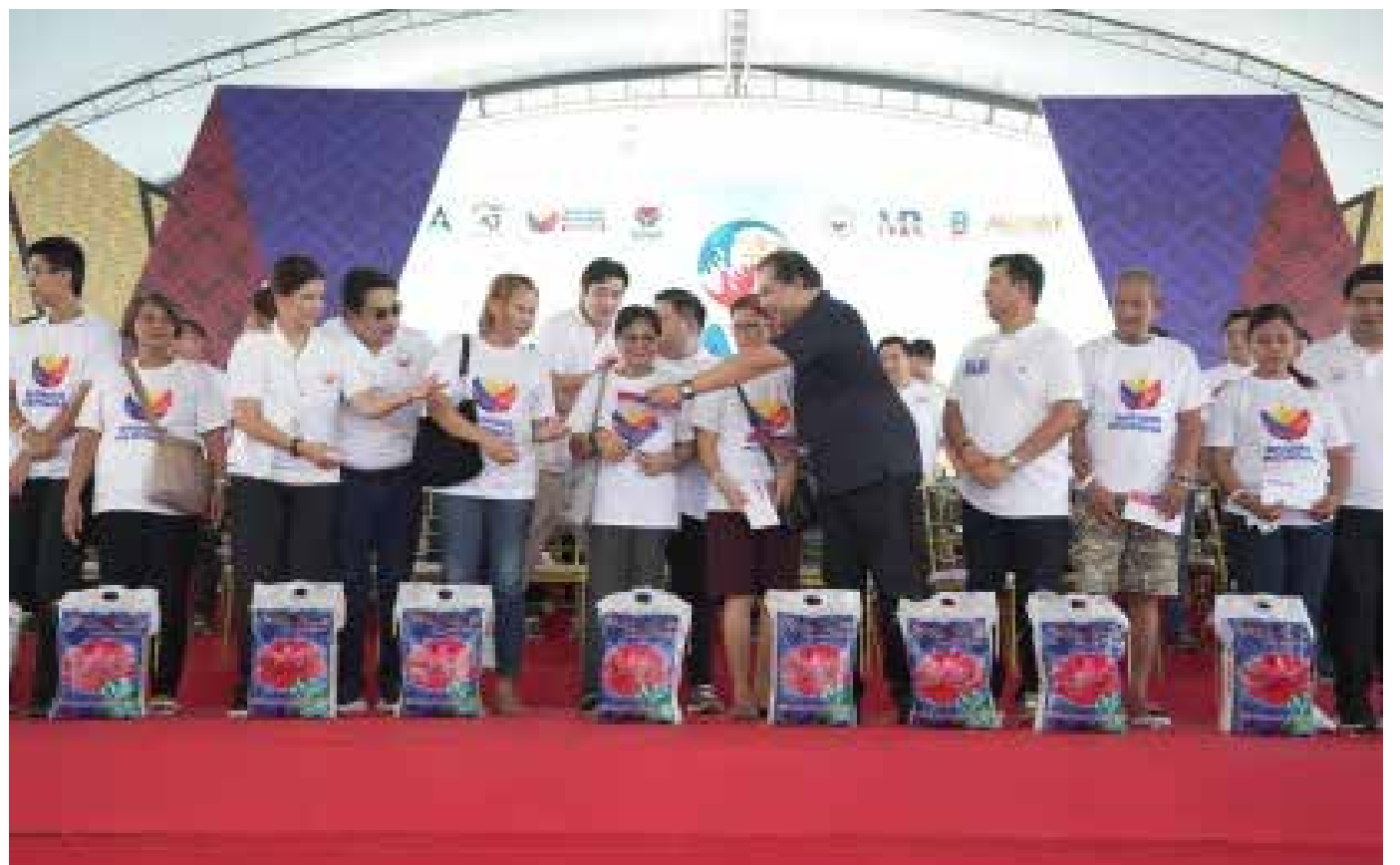
BAGONG PILIPINAS CARAVAN. Speaker Martin Romualdez leads the distribution of government assistance to indigent residents of Cavite under the Bagong Pilipinas Service Fair in Kawit, Cavite on Friday (Sept. 27, 2024). Romualdez said at least 120,000 residents benefited from cash assistance, scholarships, and livelihood programs worth PHP1 billion for Cavite province.

“These programs reflect our dedication to ensuring that no Filipino is left behind. Whether through education, financial assistance, or entrepreneurship, we are providing