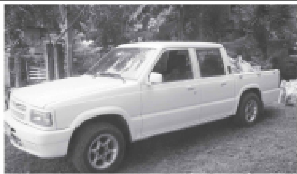
1997 Mazda B2500 pick up. strong engine and aircon, nothing to fix, nice in and out. P245K. Negotiable. 0917 627 5521

Pedro C. Andal Sr. Compound, Maharlika Hi-way, Concepcion Uno, Sariaya, Quezon contact: 0917-627-5521 / 0920-951-1248