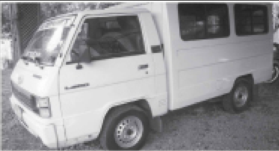
1999 Mitsubishi L300 FB, good engine, collapsible seat, nothing to fix. P235k or best offer 0920 951 1248