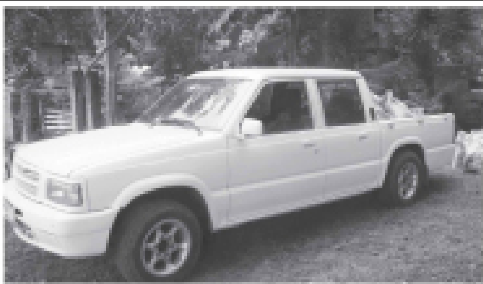
1997 Mazda B2500 pick up. strong engine and aircon, nothing to fix, nice in and out. P245K. Negotiable. 0917 627 5521

Pedro C. Andal Sr. Compound, Maharlika Hi-way, Concepcion Uno, Sariaya, Quezon contact: 0917-627-5521 / 0920-951-1248