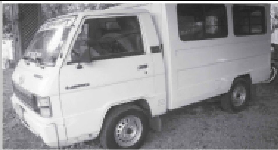
1999 Mitsubishi L300 FB, good engine, collapsible seat, nothing to fix. P235k or best offer 0920 951 1248