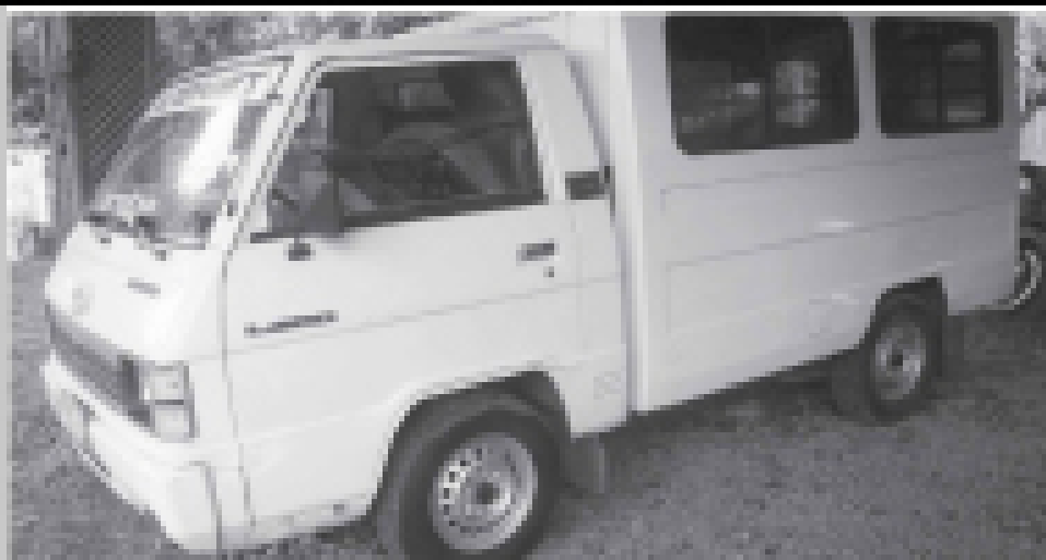
1999 Mitsubishi L300 FB, good engine, collapsible seat, nothing to fix. P235k or best offer 0920 951 1248