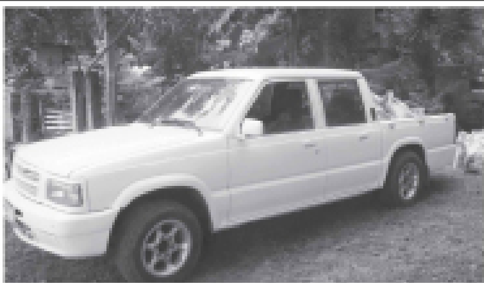
1997 Mazda B2500 pick up. strong engine and aircon, nothing to fix, nice in and out. P245K. Negotiable. 0917 627 5521

Pedro C. Andal Sr. Compound, Maharlika Hi-way, Concepcion Uno, Sariaya, Quezon contact: 0917-627-5521 / 0920-951-1248