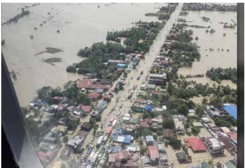
FLOODED. An aerial view of Maharlika highway in Milaor-San Fernando towns in Camarines Sur on Oct. 25, 2025, following the devastation of Severe Tropical Storm Kristine (international name Trami). Several government agencies on Thursday (Nov. 14, 2024) warned the public against driving to the Bicol Region and Matnog Port beginning Thursday at 6 p.m. to avoid being stranded in similar incidents with the coming of tropical storm Man-yi (to be named Pepito once it enters the Philippine Area of Responsibility).

Meanwhile, the Land Transportation Franchising and Regulatory Board (LTFRB) imposed a temporary suspension on all land travel by buses and trucks bound for Visayas and Mindanao via Matnog Port and other areas in the Bicol Re-