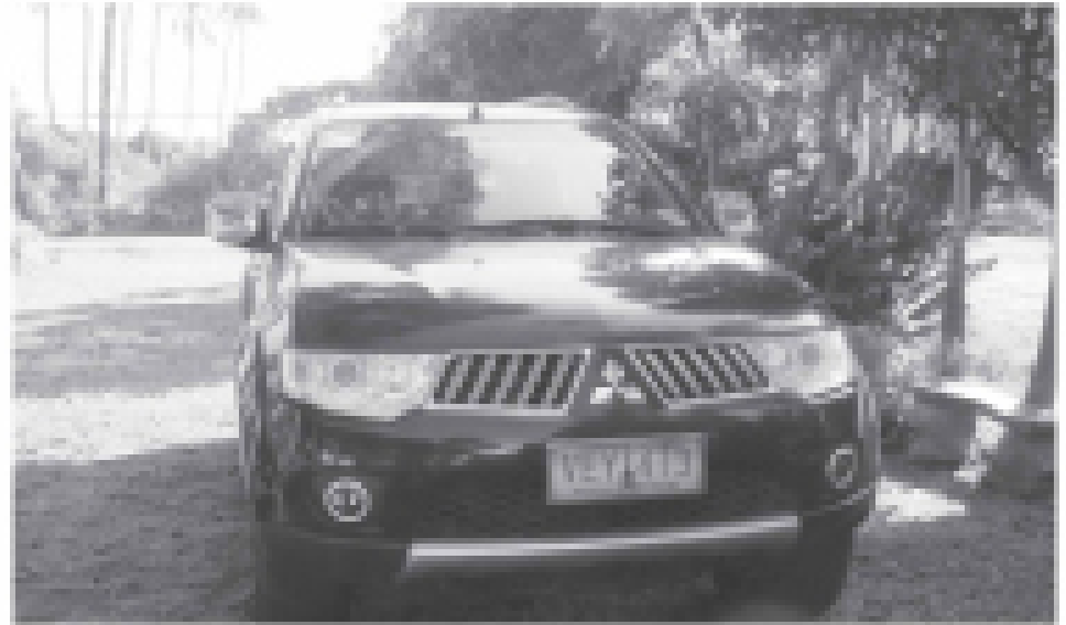
Montero 2010 model, almost new, casa maintained, 40k mileage, owner driver. Asking for P1M. Negotiable. 0920 951 1248