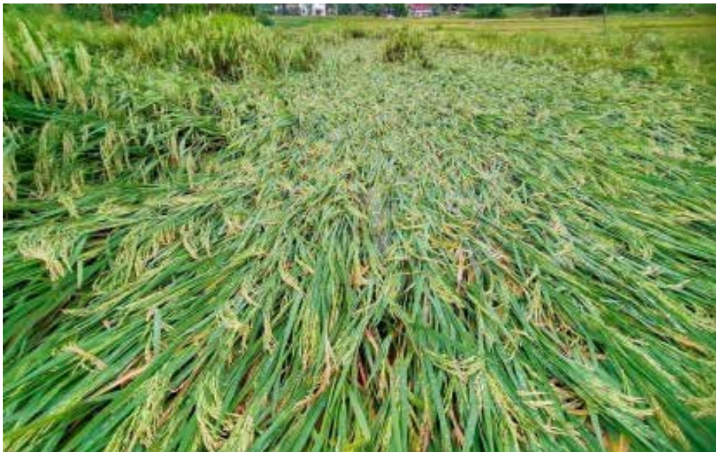
RECOVERY ASSISTANCE. A typhoon-hit rice field after the onslaught of Tropical Storm Kristine (international name Trami) in Pinili, Ilocos Norte in an undated photo. The Department of Agriculture said Thursday (Nov. 14, 2024) that various loan programs are available for farmers affected by disasters to help them recover.