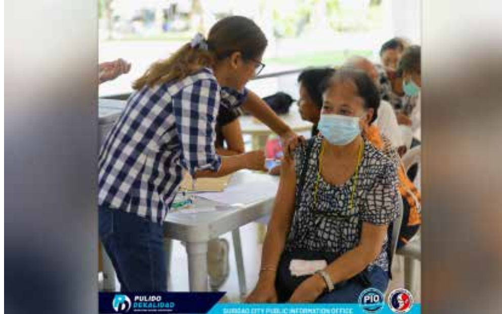
IMMUNIZATION FOR ELDERLY. A senior citizen gets vaccinated in this Oct. 16, 2023 photo. Agri Party-list Rep. Wilbert Lee on Thursday (Nov. 14, 2024) said he filed House Bill No. 11055, which seeks to provide free vaccines against infectious diseases to all senior citizens in the country.

“Tayong mga Pilipino ay malaki ang pagpapahalaga sa ating mga lolo at lola, sa ating mga magulang na nag-alaga at nagpalaki sa atin, at nagtaguyod sa ating pamilya. Sa kanilang pagtanda, sila naman ang gusto nating arugain at talagang dapat pagkalooban ng karampatang kalinga (We Filipinos greatly value our grandparents and parents who cared for and raised us. In their old age, we wish to care for them and given them appropriate attention),” Lee said.