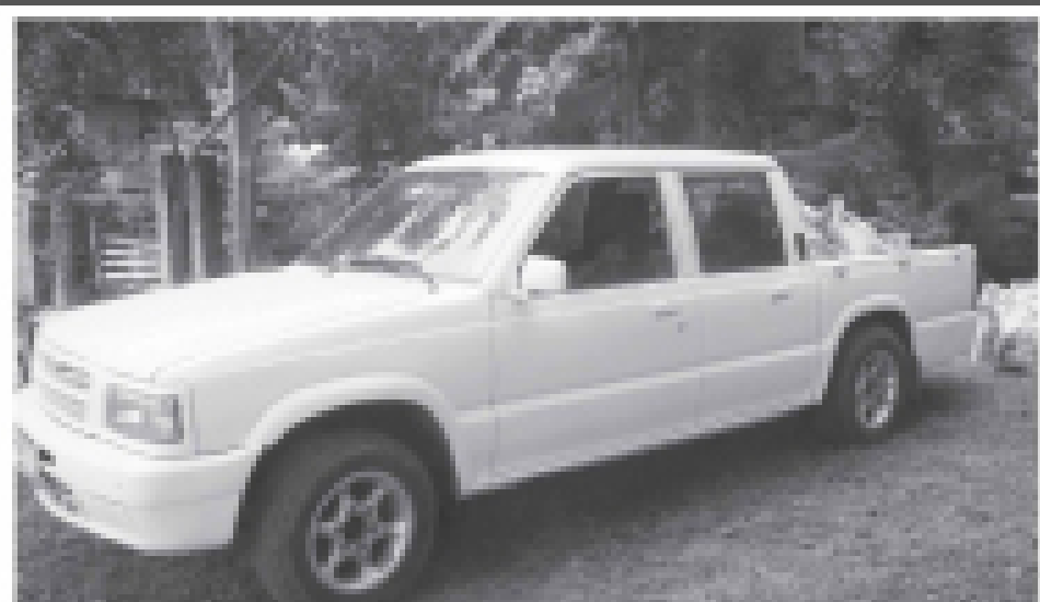
1997 Mazda B2500 pick up. strong engine and aircon, nothing to fix, nice in and out. P245K. Negotiable. 0917 627 5521

Pedro C. Andal Sr. Compound, Maharlika Hi-way, Concepcion Uno, Sariaya, Quezon contact: 0917-627-5521 / 0920-951-1248