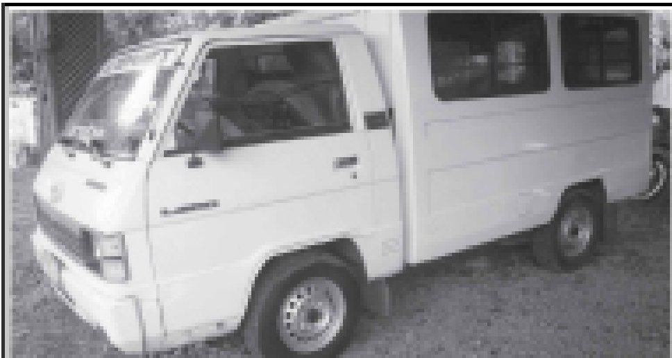
1999 Mitsubishi L300 FB, good engine, collapsible seat, nothing to fix. P235k or best offer 0920 951 1248