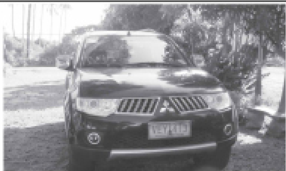
Montero 2010 model, almost new, casa maintained, 40k mileage, owner driver. Asking for P1M. Negotiable. 0920 951 1248