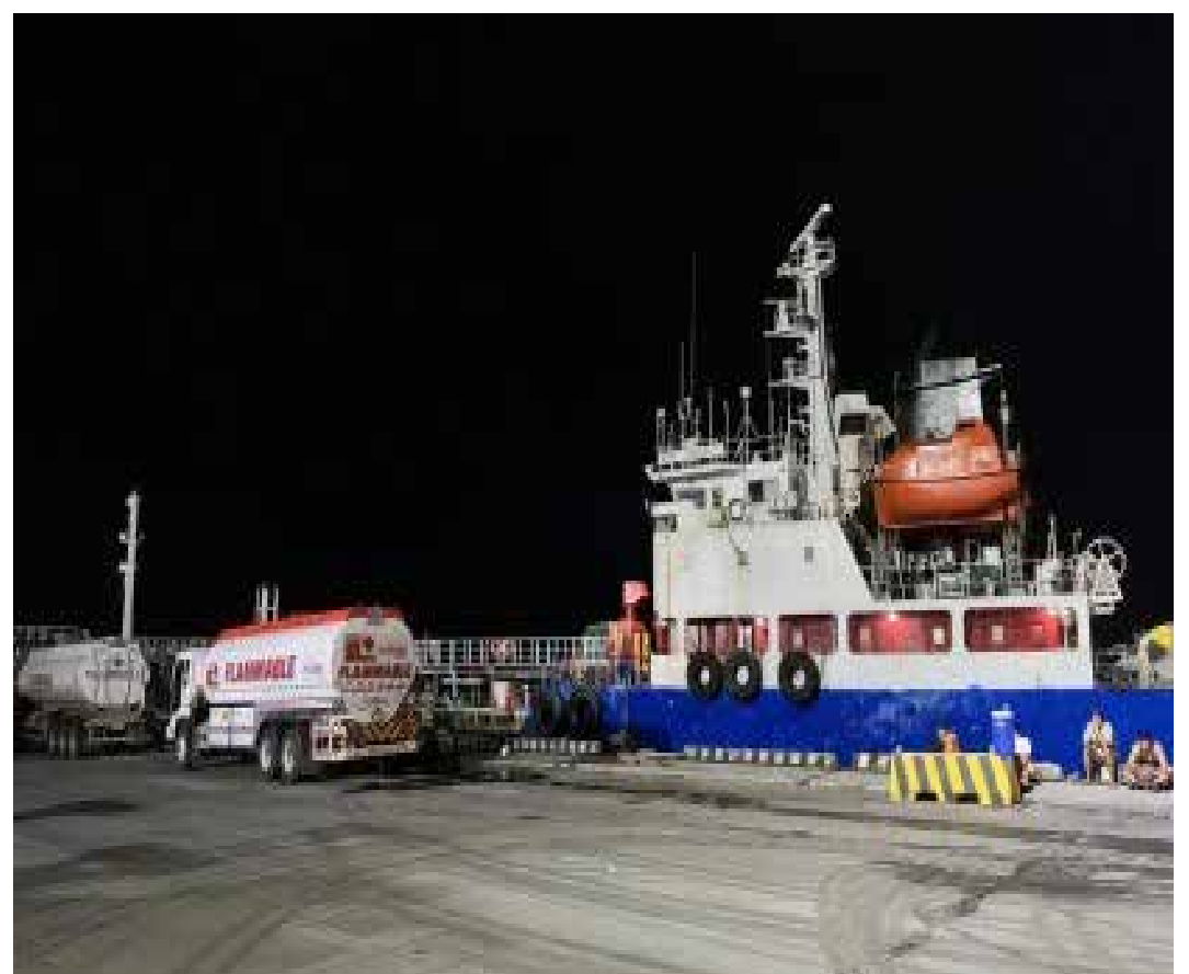
‘PAIHI’ MODUS. Oil tanker MTKR Cassandra and four fuel trucks are impounded at the Port of Batangas after these were seized by Customs authorities on Tuesday (Oct. 15, 2024). The BOC on Thursday (Oct. 17) said the tanker and the trucks were caught engaging in “paihi” or transferring unmarked fuel.

to provide documents, except for the crew’s seaman’s books.