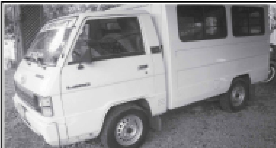
1999 Mitsubishi L300 FB, good engine, collapsible seat, nothing to fix. P235k or best offer 0920 951 1248