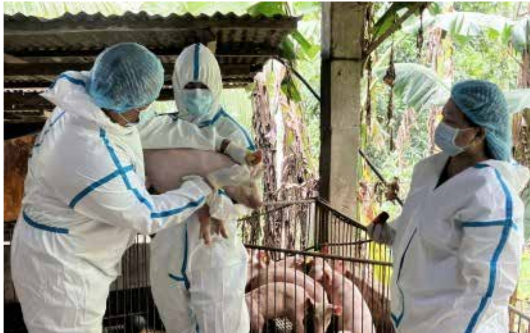
ASF VACCINATION. Bureau of Animal Industry staff conduct the first government-controlled vaccination against African swine fever in Lobo, Batangas on Aug. 30, 2024. Agriculture Secretary Francisco Tiu Laurel Jr. on Friday (Oct. 18) ordered the refinement of protocols to fast-track the ASF vaccination.

urgency to secure approval for the vaccine’s commercial use, alongside stringent biosecurity measures to help prevent further spread of ASF nationwide.