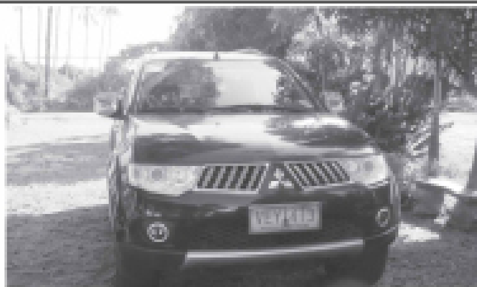
Montero 2010 model, almost new, casa maintained, 40k mileage, owner driver. Asking for P1M. Negotiable. 0920 951 1248