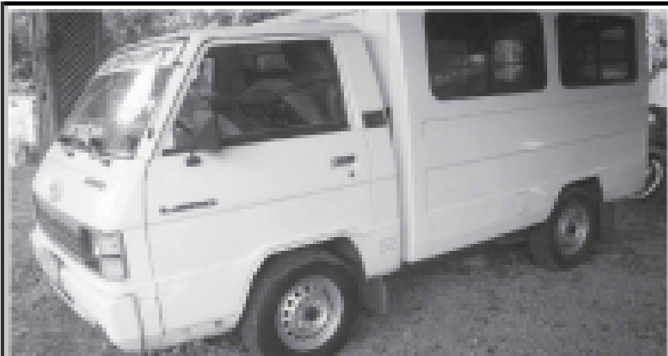
1999 Mitsubishi L300 FB, good engine, collapsible seat, nothing to fix. P235k or best offer 0920 951 1248