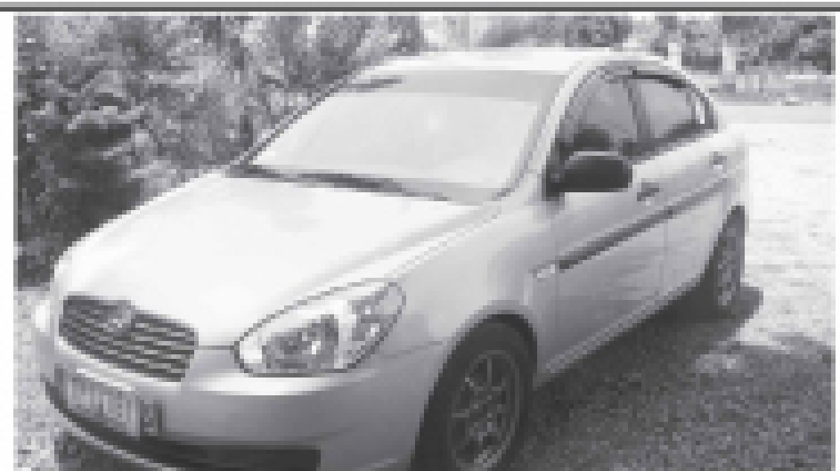
Hyundai Accent CRDI 2012 model, casa maintained, under factory warranty, leather seat, 15 magwheels, perfect condition, owner driven. Negotiable at P650,000

Honda City 2015 Honda City VX AT 480k obo End plate 3, registration current -First owned, purchased brand new 928.962.9589