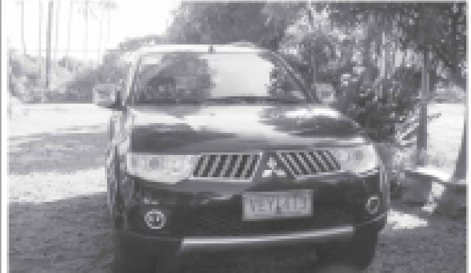
Montero 2010 model, almost new, casa maintained, 40k mileage, owner driver. Asking for P1M. Negotiable. 0920 951 1248