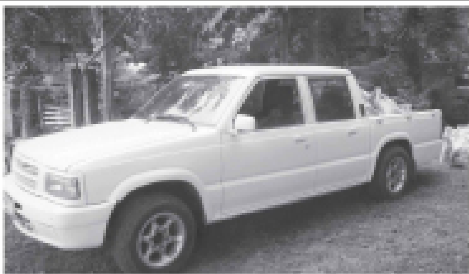
1997 Mazda B2500 pick up. strong engine and aircon, nothing to fix, nice in and out. P245K. Negotiable. 0917 627 5521

Pedro C. Andal Sr. Compound, Maharlika Hi-way, Concepcion Uno, Sariaya, Quezon contact: 0917-627-5521 / 0920-951-1248