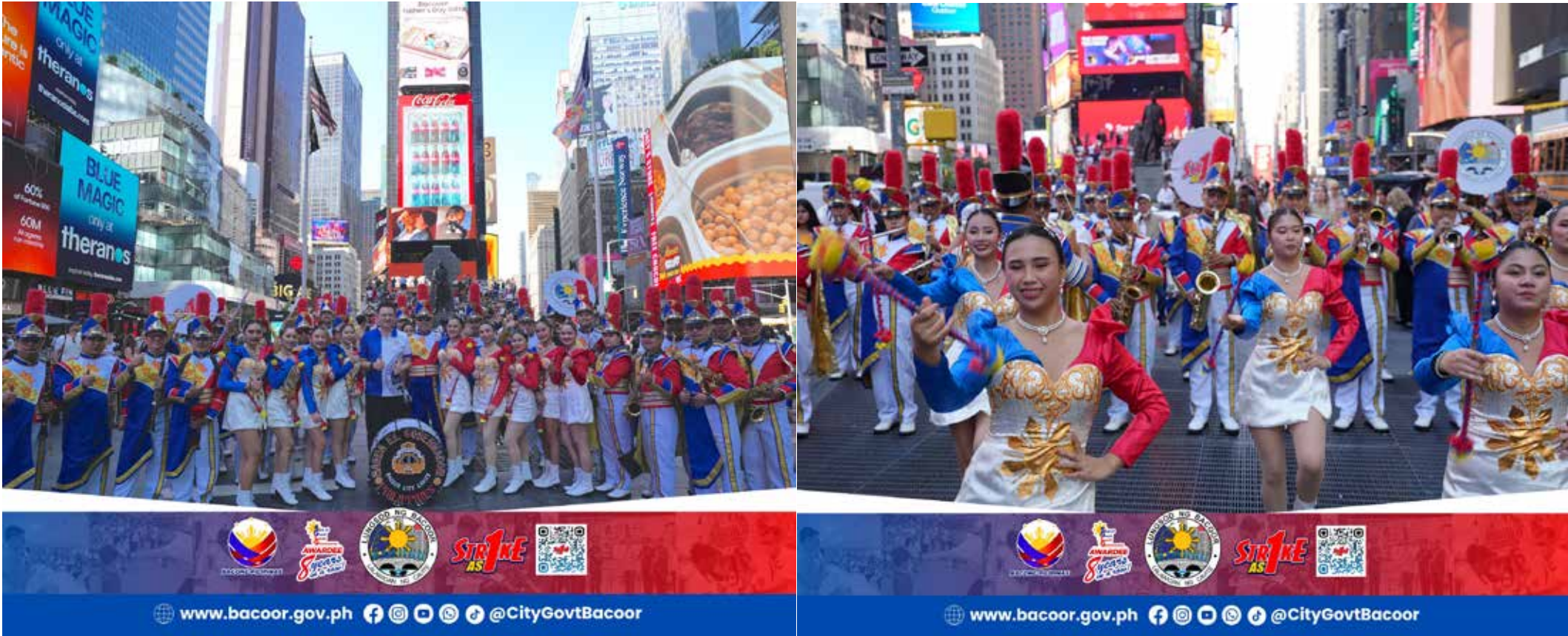
June 4, 2025 - El Gobernador Band showcased world-class musical talent at Time Square in New York—a proud moment for Bacoor and the entire Filipino nation, proving that from the streets of Bacoor City to the heart of New York, Bacooreño talent shines on the global stage!