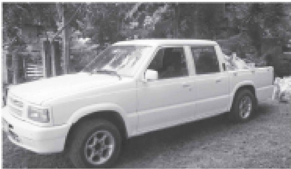
1997 Mazda B2500 pick up. strong engine and aircon, nothing to fix, nice in and out. P245K. Negotiable. 0917 627 5521

Pedro C. Andal Sr. Compound, Maharlika Hi-way, Concepcion Uno, Sariaya, Quezon contact: 0917-627-5521 / 0920-951-1248