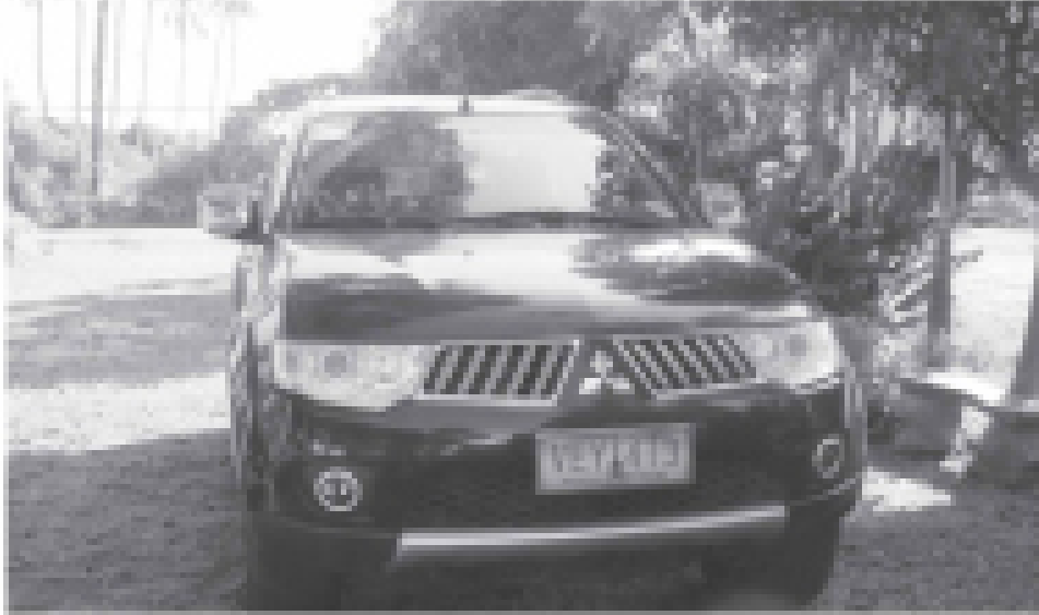
Montero 2010 model, almost new, casa maintained, 40k mileage, owner driver. Asking for P1M. Negotiable. 0920 951 1248