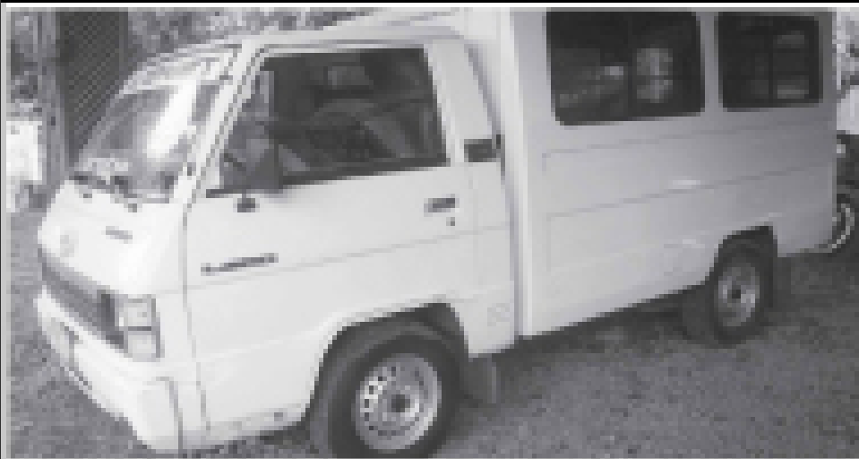
1999 Mitsubishi L300 FB, good engine, collapsible seat, nothing to fix. P235k or best offer 0920 951 1248