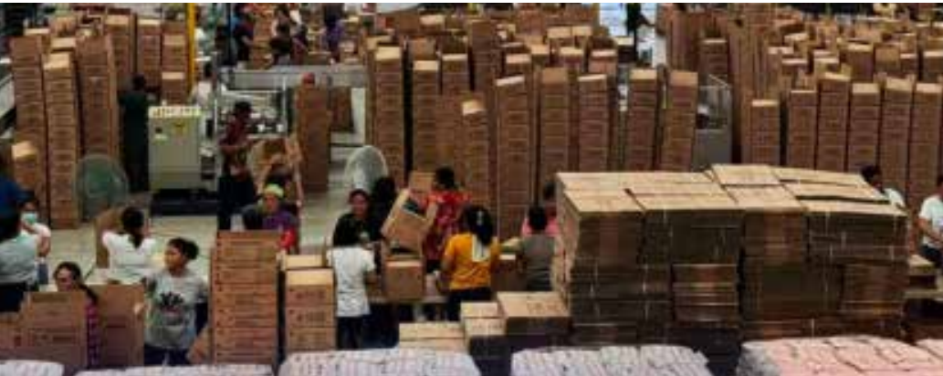
DISASTER RESPONSE. Volunteers help repack family food packs (FFPs) at the Department of Social Welfare and Development’s (DSWD) National Resource Operations Center in Pasay City in this undated photo. As of Friday (June 6, 2025), the DSWD has over three million boxes of FFPs prepositioned in 938 warehouses nationwide to ensure prompt and efficient disaster response operations.

for it to develop into a tropical cyclone, the Philippine Atmospheric, Geophysical and Astronomical Services Administration warned that moderate to heavy rains brought by the “habagat” and the trough of the LPA could result in floods or landslides in Metro Manila, Calabarzon, Mimaropa, Zamboanga Peninsula, BARMM, Soccsksargen and the Visayas.