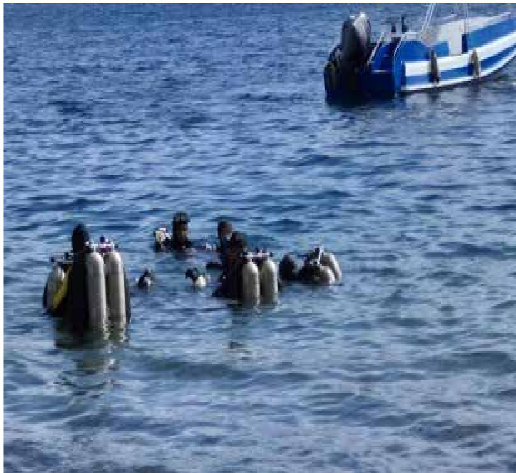
SEARCH IS ON. Divers from the Philippine Coast Guard (PCG) surface during search operations at Taal Lake in Batangas on Thursday (July 10, 2025). The PCG began technical dives and site assessment at the lake as part of the search for the 34 missing “sabungeros” allegedly buried in the lake.

I kego at all-in na po ang gobyerno dito mas marami na pong lumapit pa na informants so this is a step in the right direction sa tingin po natin but we will not stop here. Hindi lang naman po ito ang lead natin pero isa sya sa pinaka malaking lead (This is an investigation that we previously had no leads for. Now that a witness has surfaced and the government is all-in on this, more informants have come forward so this is a step in the right direction in our opinion, but we will not stop here. This is not our only lead, but it is one of the biggest leads),” he added. (PNA)