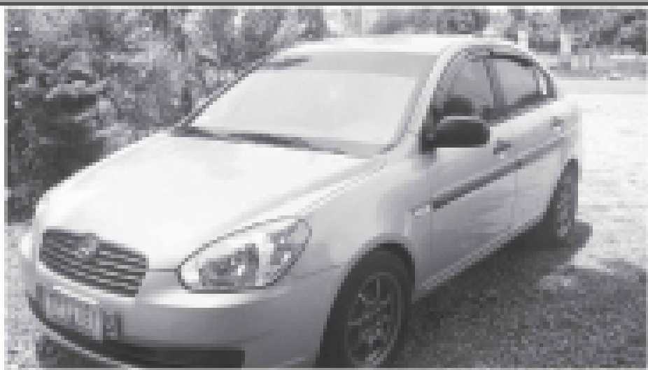
Hyundai Accent CRDI 2012 model, casa maintained, under factory warranty, leather seat, 15 magawheels, perfect condition, owner driven. Negotiable at P650,000

Honda City 2015 Honda City VX AT 480k obo End plate 3, registration current -First owned, purchased brand new 928.962.9589