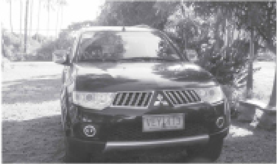
Montero 2010 model, almost new, casa maintained, 40k mileage, owner driver. Asking for P1M. Negotiable. 0920 951 1248