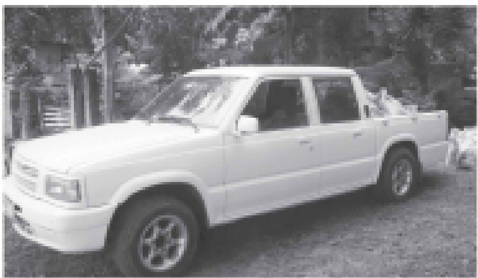
1997 Mazda B2500 pick up. strong engine and aircon, nothing to fix, nice in and out. P245K. Negotiable. 0917 627 5521

Pedro C. Andal Sr. Compound, Maharlika Hi-way, Concepcion Uno, Sariaya, Quezon contact: 0917-627-5521 / 0920-951-1248