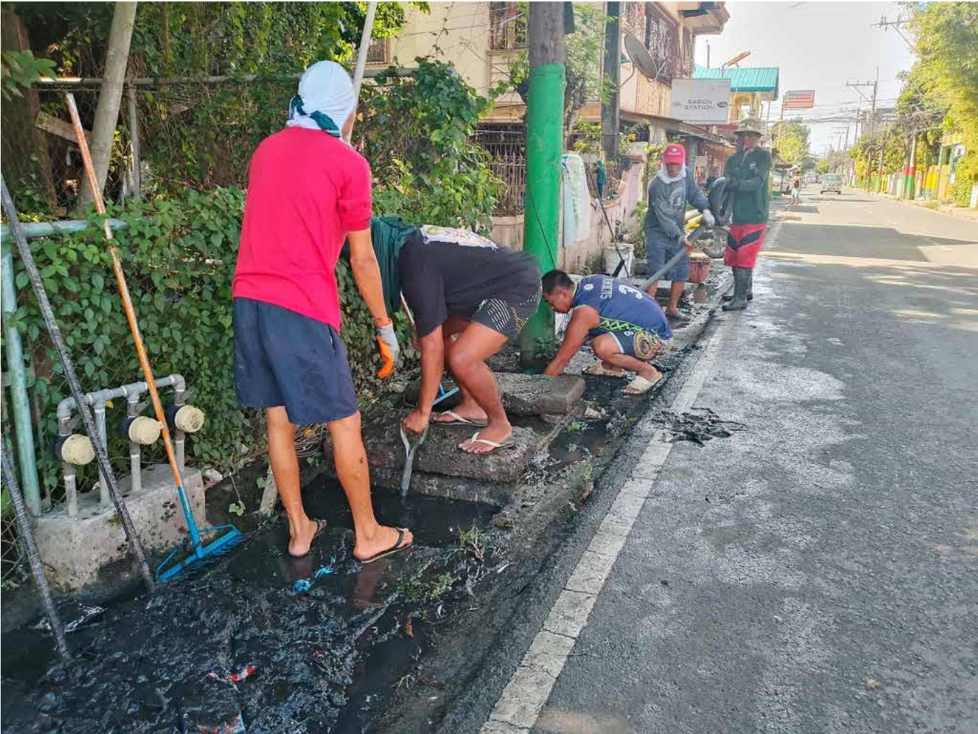
Local authorities are urging residents in these areas to remain vigilant and proactive, and to report any blocked canals or waste accumulation to their barangay offices. With the monsoon season already bringing heavy rains, this executive order is expected to play a key role in protecting communities and minimizing flood-related disruptions.

Some of the barangays that are prone to perennial flooding are Barangay San Rafael I, Barangay San Rafael II — particularly Molave Street and the Countryside Subdivision — Barangay San Rafael III, Barangay San Juan (especially near the 7-Eleven area), Barangay Salcedo II (especially the Pechayan area), and the vicinity around Noveleta National High School (Salud Subdivision, also in Brgy. San Rafael II).