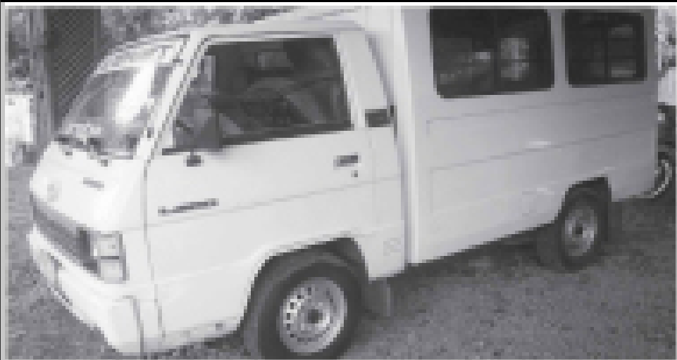
1999 Mitsubishi L300 FB, good engine, collapsible seat, nothing to fix. P235k or best offer 0920 951 1248